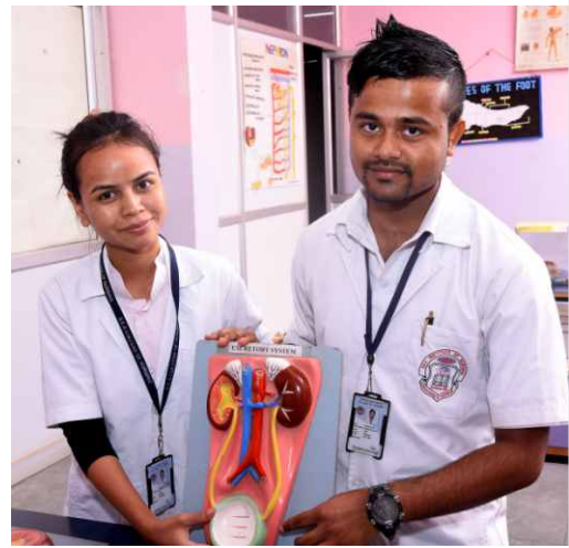
Students in Anatomy Lab