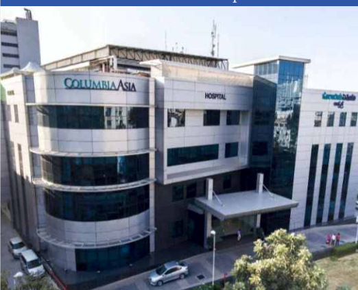
Columbia Asia Hospital