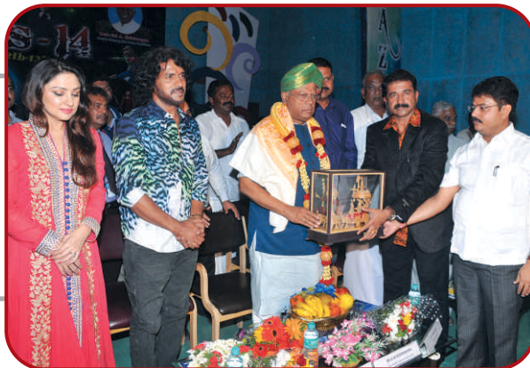
Shri. G. M. Siddeshwara, Minister of State for Civil Aviation of India at SEAET "SEAZONS"