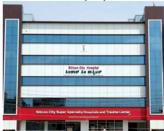
Silicon City Hospital