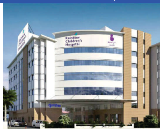
Rainbow Children's Hospital