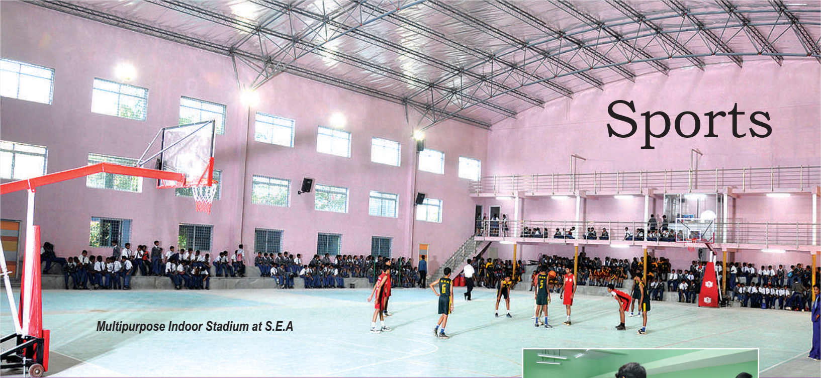
Multipurpose Indoor Stadium at S.E.A