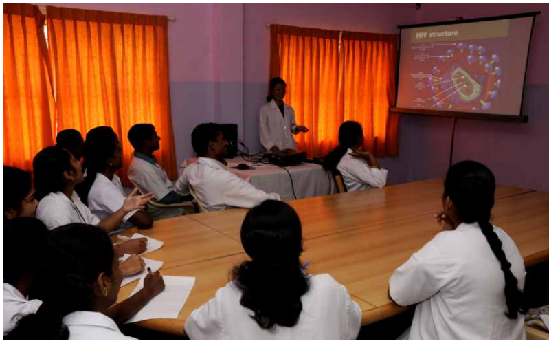
Staff Development Programme