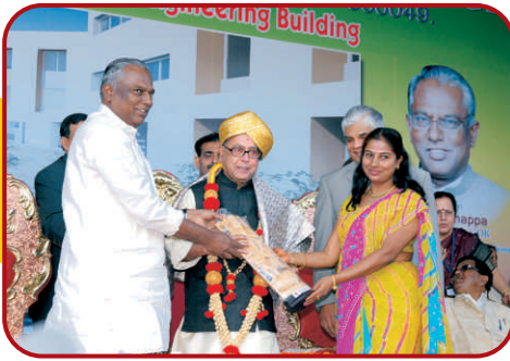
Inauguration of SEACET building by his Excellency Shri. Pranab Mukherjee, Hon'ble President of India