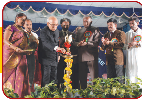
Excellency Shri. Hans Raj Bharadwaj, Hon'ble Governor of Karnataka at SEAET "Dashajyothi Program"