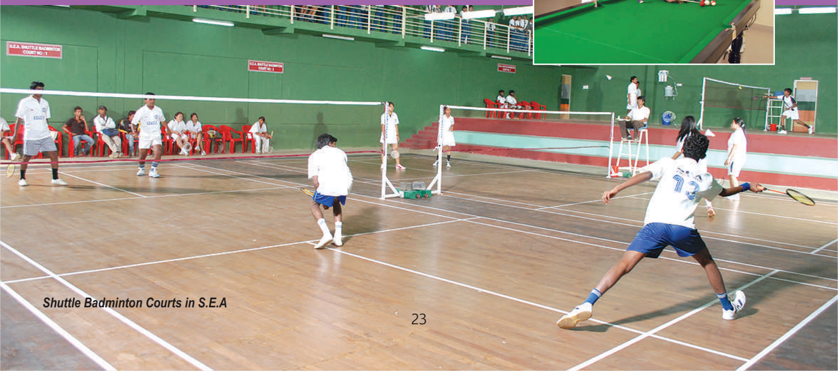
Shuttle Badminton Courts in S.E.A